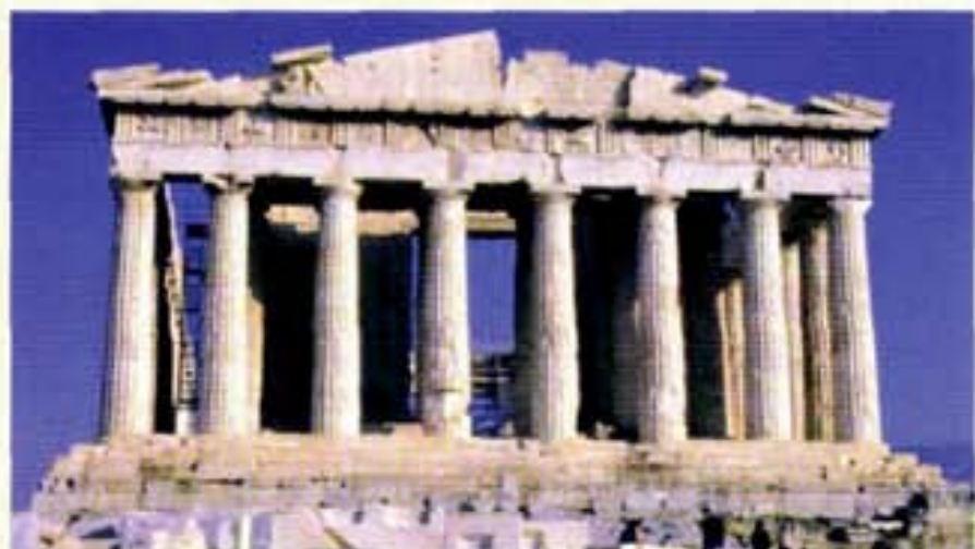
The Parthenon was built in the 5th century BC. It is visited by thousands of tourists every year.

We form the passive with the verb to be and the past participle of the main verb.